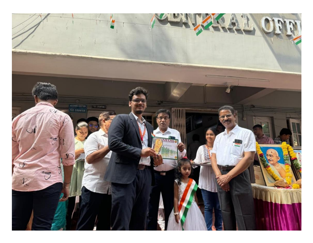
Committed to Excellence in Higher EduCAtion